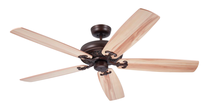
C. Shown in Venetian Bronze with Natural Blades (G60NA)